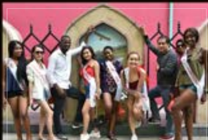
SULTAN MOSQUE, SINGAPORE