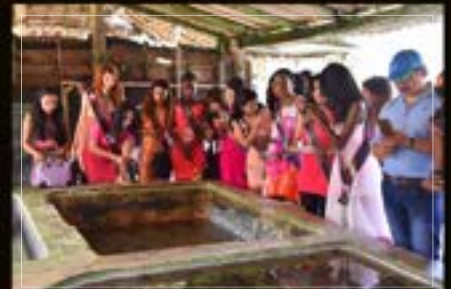
TURTLE CONSERVATION, SRI-LANKA