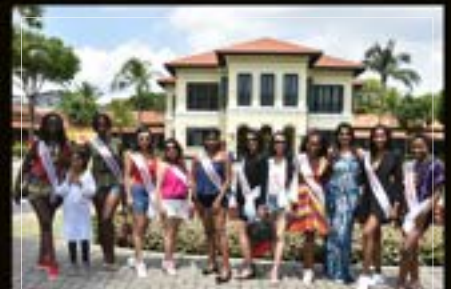
MALAY HERITAGE CENTRE, SINGAPORE