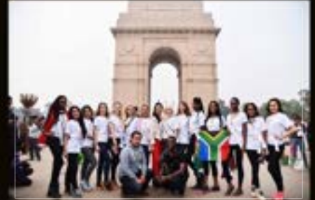
INDIA GATE, INDIA