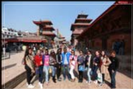
PATAN DURBAR SQUARE, UNESCO HERITAGE SITE, NEPAL