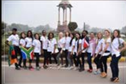
INDIA GATE, UNESCO HERITAGE SITE, INDIA