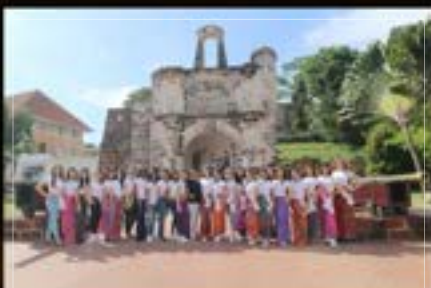
A FAMOSA, FORTRESS IN MALACCA CITY, MALAYSIA