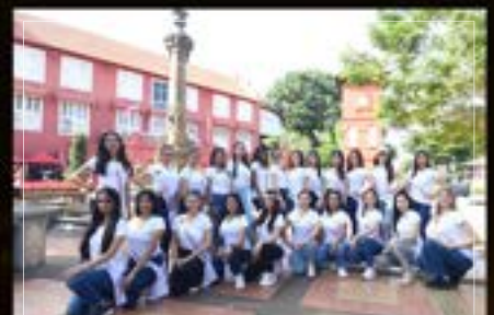
RED SQUARE, MALACCA UNESCO HERITAGE SITE, MALAYSIA