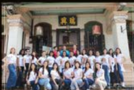
BABA & NYONYA HERITAGE MUSEUM, MALAYSIA