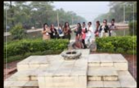
LUMBINI (BIRTH PLACE OF LORD BUDDHA), NEPAL