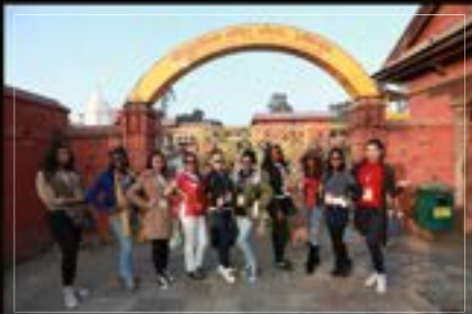
PASHUPATINATH TEMPLE, UNESCO HERITAGE SITE, NEPAL