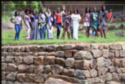
POLONNARUWA, UNESCO HERITAGE SITE, SRI-LANKA