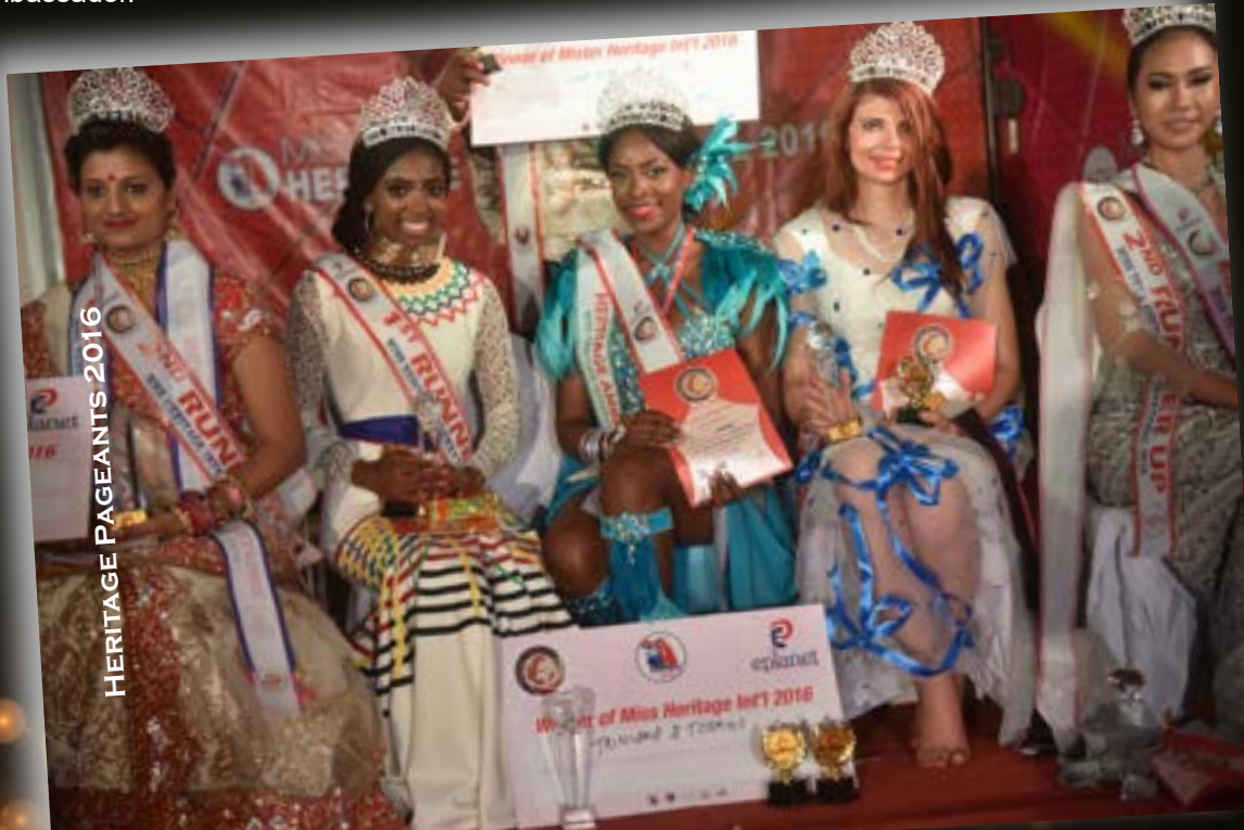
HERITAGE PAGEANTS 2016