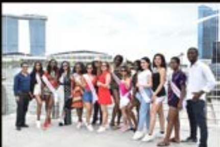
ICONIC LANDMARK MARINA BAY SAND, SINGAPORE