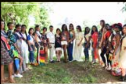
SIGIEYA, UNESCO HERITAGE SITE, SRI-LANKA