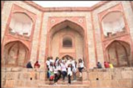
HUMAYUNS TOMB, UNESCO HERITAGE SITE, INDIA